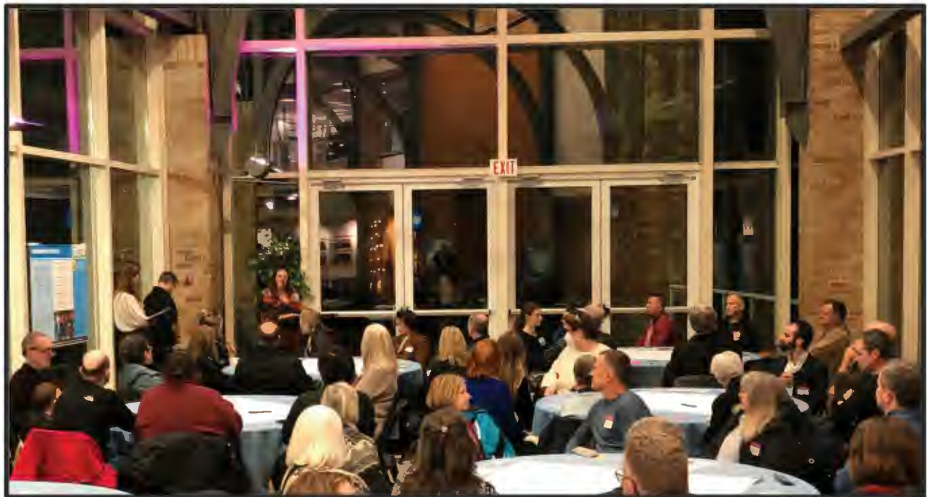
February 2 nd Dialogue Session