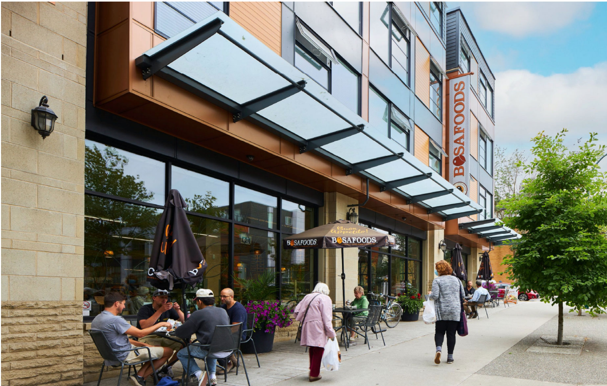
Bosa Foods Victoria Drive Location - View of the Street Patio on Victoria Drive