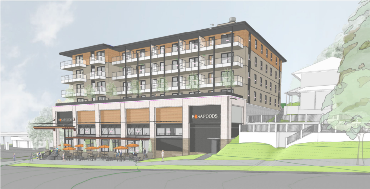
View of the Proposed building fronting St Johns Street, and its relationship to the heritage home next door

To facilitate a proper pedestrian retail experience, it is necessary to have the retail building at grade level at St Johns. We want to welcome users from the street and the intersection specifically, as much of the current pedestrian and vehicular uses exist on the north side of St John's.