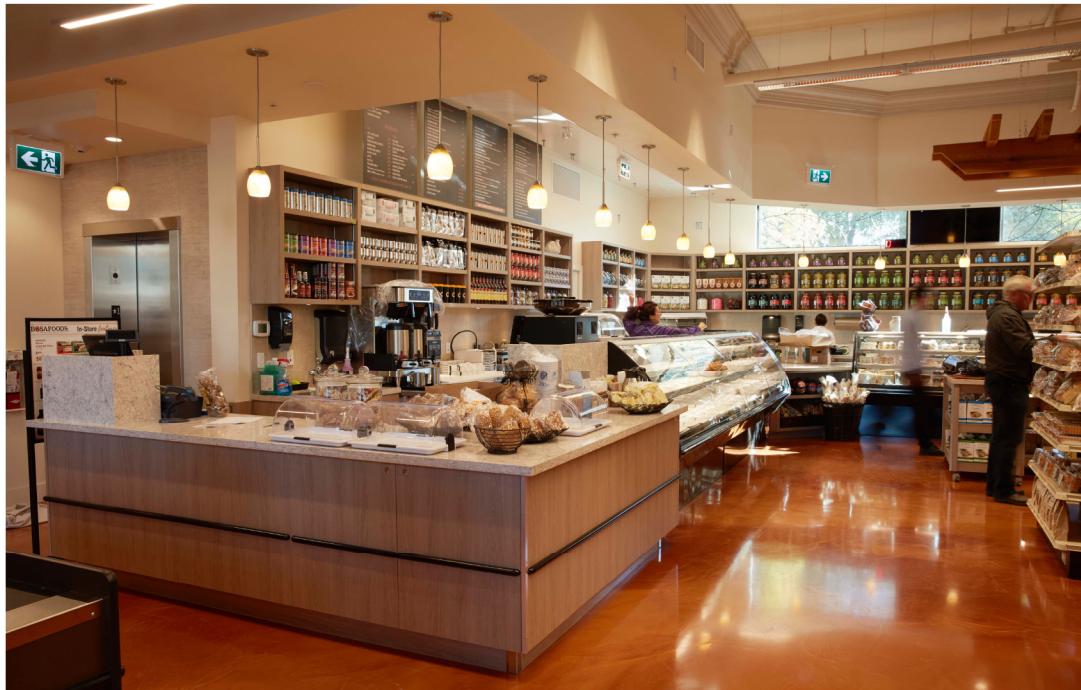
Bosa Foods Victoria Drive Location – Deli Counter

Bosa Foods is committed to bringing a quality retail food store experience to the community of Port Moody! While a specialty food store brand with an international flavour, the pricing structure and variety of product lines result in several pricing levels and make it competitive with local grocers on similar items. Two sites on St Johns Street at Queens have been acquired to support this initiative, and a portion of City land previously designated for closure is also considered in the proposal. The location is easily accessible by transit and has enough space to accommodate a high-density residential component above the food store retail level. Our proposal is to make 100% of that residential component rental, which is sorely needed in the neighbourhood. We believe that this mixed-use development can anchor the west end of the St Johns commercial corridor and provide a smooth transition to the residential areas to the West.