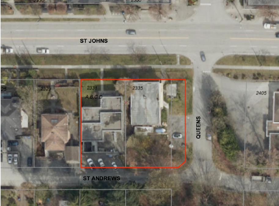
Proposed Site Including 6m of the Queens Road Allowance

The site is bordered on the south by St Andrews St which is a very narrow (33') street. The site has a 38.55 ft change in grade from the SW corner to the NE corner at the intersection of St Johns and Queens which is a challenge but also presents some interesting opportunities to create significant rental housing at a reasonable scale.