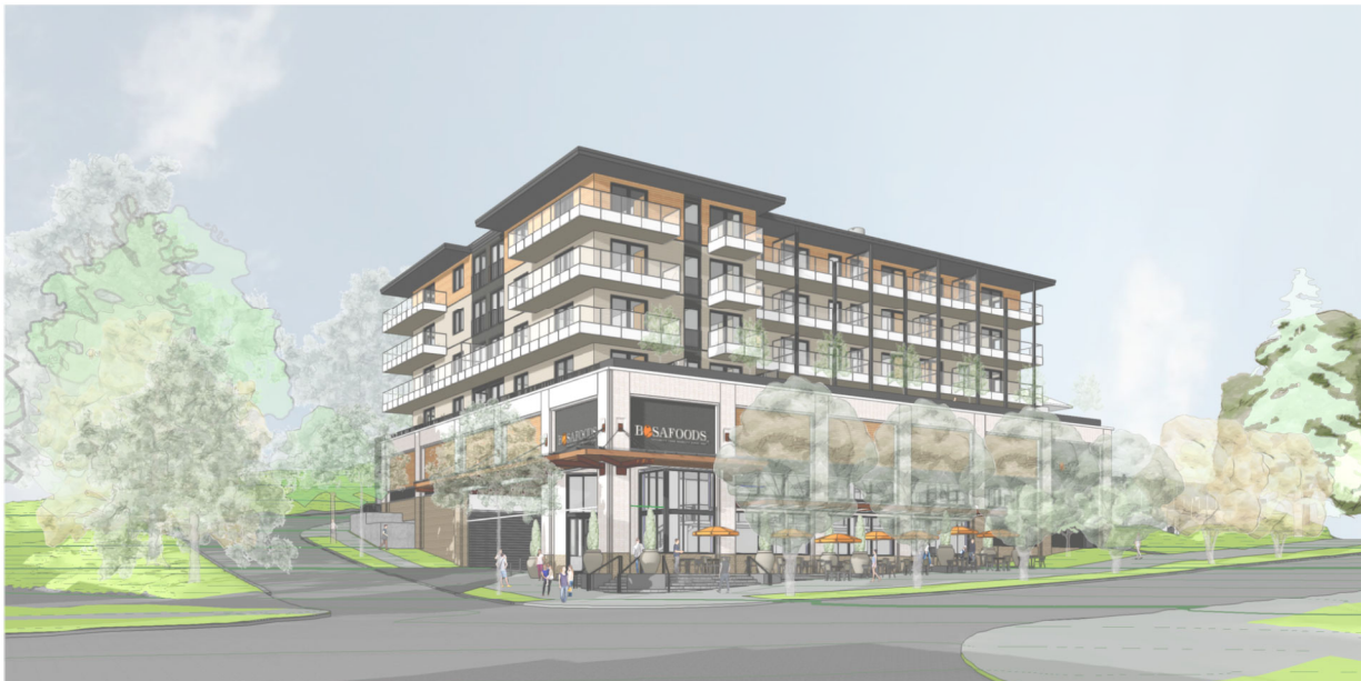
Proposed building – Northeast corner

The project is conceived essentially as two buildings, a retail building facing St Johns and a residential rental apartment facing St Andrews. The food store fronts St Johns at a grade close to that of the street to create a podium for the residential addition above. The residential building is set back from St Andrews, Queens and St Johns making use of the podium for outdoor space to serve the ground floor suites. The level 3 main entry children's play area will have artistic elements like colour, shape, texture, and theme. The use of organic shapes also creates a more natural and playful feel to the play structure. Materials like wood, metal, and plastic add variety and interest. The roof top has a greenhouse and outdoor garden for use by the residents.