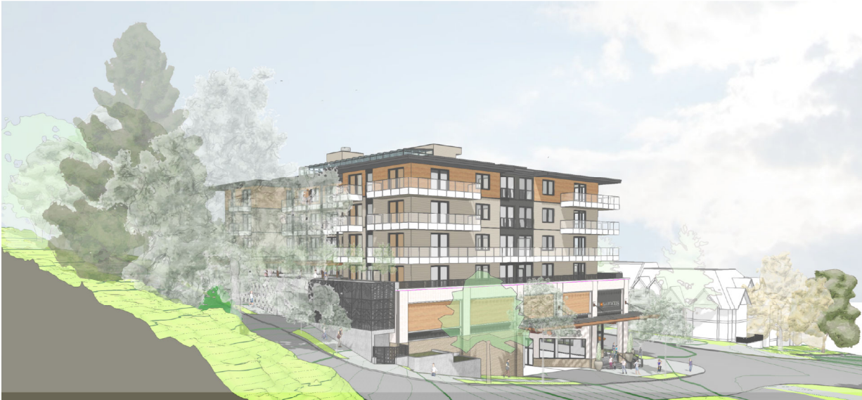
Commercial parkade entry from Queens and Residential parkade entry from St Andrews (Southeast corner)

The residential front entry and parkade entry are taken from St Andrews St. We have located the residential garage entry as far from the intersection as possible given the steep grade along St Andrews. This is a quiet street that only accommodates local traffic. The residential entry is located along the upper portion of St Andrews where the street grade matches the main floor grade. A rooftop amenity space offers a greenhouse and a spacious outdoor patio. The greenhouse provides a year-round gardening opportunity and a pleasant environment for relaxation. It will be heated using surplus