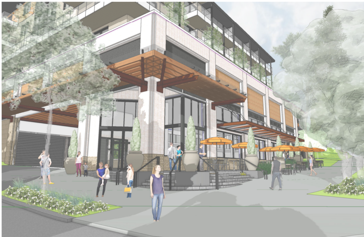
Proposed retail entry on St Johns Street with covered patio and outdoor seating

The retail entry area is positioned to allow direct access from the underground parking area as well as the street with security provided by the checkout tills. There is grade level access from Queen Street at this location. We are proposing a large patio area along St Johns to animate the street. The store will support its use with fresh coffee, baking and sandwiches from the deli area. The proposal shows a level patio with some grade work on the municipal right of way to create level comfortable seating.