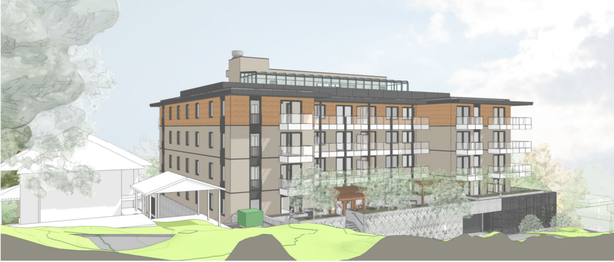
Southwest corner view from the lane

heat generated by the food store refrigeration system. The patio is ideal for hosting events or enjoying the views of the city.