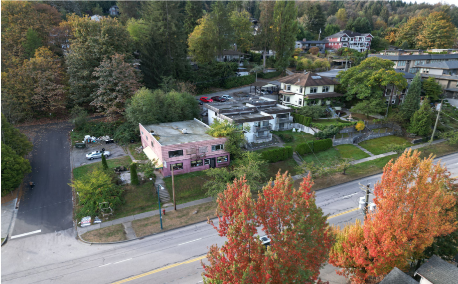
Aerial Photo showing the large grade change and steep slope of Queens and St Andrews as well as the mature trees on the uphill side of St Andrews