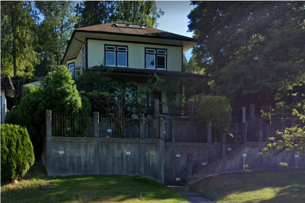
Existing Listed Heritage Residence West of the Site

There is a small single family heritage house on the upper part of the lot immediately west of the site. This is a listed residence with what looks like some updating of windows and the addition of skylights. The residence is set back on the lot at a level close to our proposed podium level. The existing house has a series of embankments and retaining walls to transition the grade uphill to the building. We have stepped back the massing of the residential portion of the building to improve sidelines and respect the heritage home.