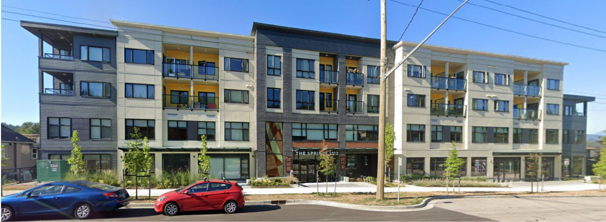
The Springs – a Four Storey building recently completed on St Johns within the Heritage Area

portion of the building is more appropriate for the character of the neighbourhood and abandons the urban design approach of the Food Store brand that we utilized in other municipalities.