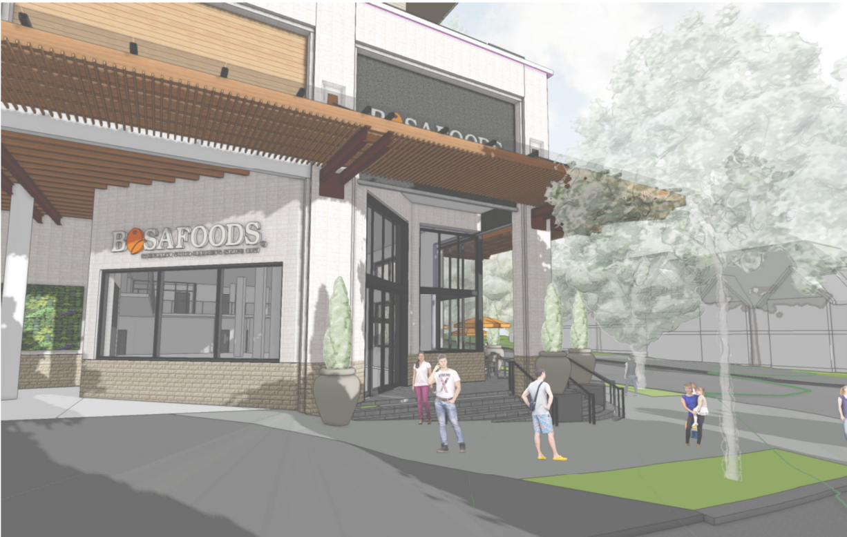
Parkade entry from Queen Street

To facilitate a proper pedestrian retail experience, it is necessary to have the retail building at grade level at St Johns. We want to welcome users from the street and the intersection specifically, as much of the current pedestrian and vehicular uses exist on the north side of St John's.