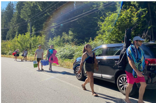
Lack of parking forces people to park further and walk on Bedwell Bay Road – Summer 2020