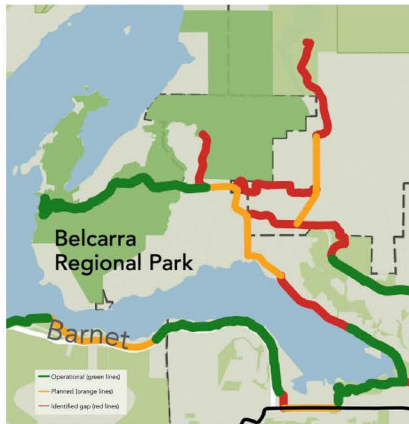
Metro Vancouver Regional Greenways 2050 Plan November 18, 2020