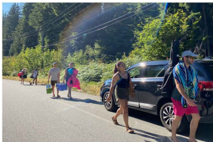
Lack of parking forces people to park further and walk on Bedwell Bay Road – Summer 2020