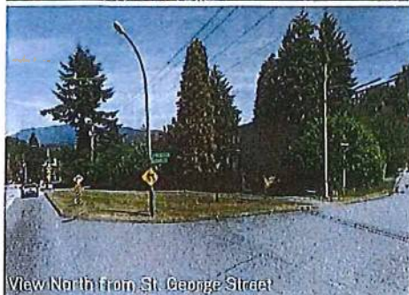
View North from St. George Street